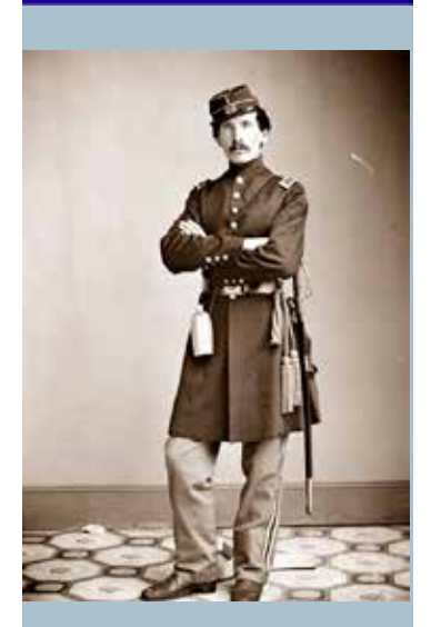
Infantry Uniform (above) Naval uniform (below)