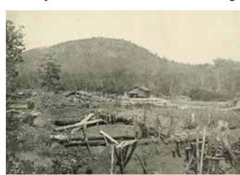
"Federal entrenchments at the foot of Kennesaw Mountain"

About 2 miles (3.2 km) to the south, Thomas's troops were behind schedule, but began their main at-