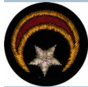
7th corps Kepi patch