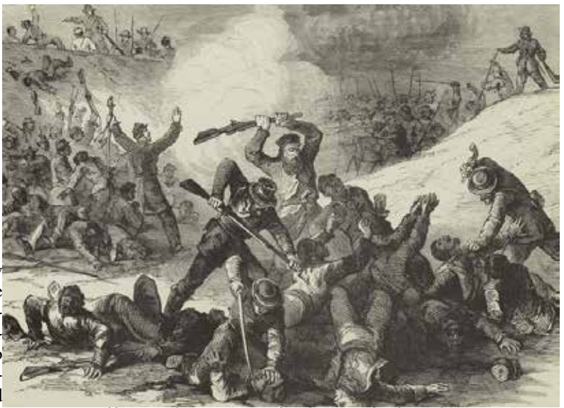
Caption in Frank Leslie's Illustrated Newspaper (New York), May 7, 1864- "The war in Tennessee: Confederate massacre of black

Two negro soldiers, wounded at Fort Pillow, were buried by the rebels, but afterward worked themselves out of their