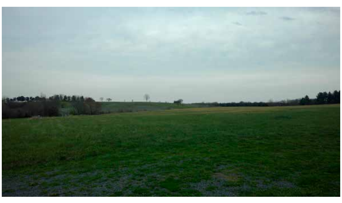
The site of the battle, seen in 2017