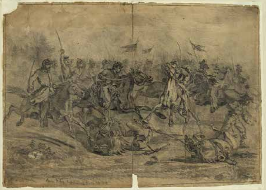
"Cavalry Charge Near Brandy Station, Virginia", a drawing by Edwin Forbes of the