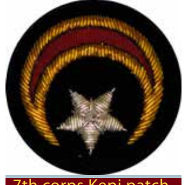
7th corps Kepi patch