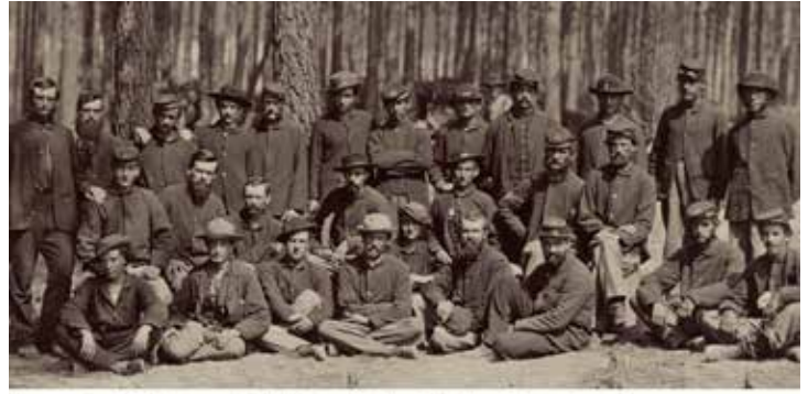
"Essayons Dramatic Club," a group of the U.S. Engineer Battalion, at Petersburg, Virginia (Engret Congress

Soldiers who had not brought their own Bible could obtain a free copy from the U.S. Christian Commission. When they had no reading matter they wrote it themselves, some-