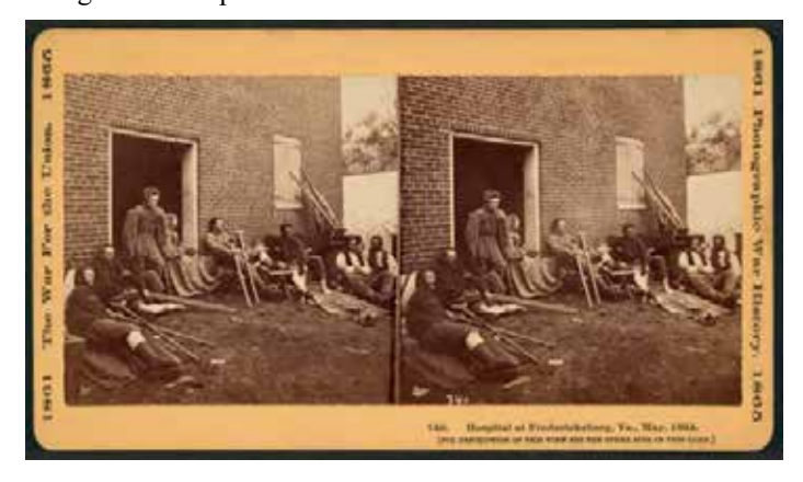
Photo of soldiers convalescing outside a hospital in Fredericksburg, VA in May 1864.

Soldiers' experiences in a Civil War hospital varied depending on its location and what kind of hospital they were treated in. At the beginning of the Civil War, both the Union and the Confederate Medical Departments were unprepared for the number of causalities unleashed. In 1861, there were two types of hospitals that surgeons operated in: field hospitals and general hospitals.