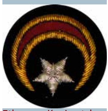
7th corps Kepi patch

Location -Currently -Lincoln Twp Public Library