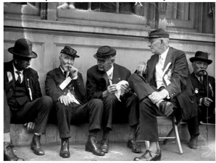
Comrades sharing stories at the 1927 National Encampment in Grand Rapids