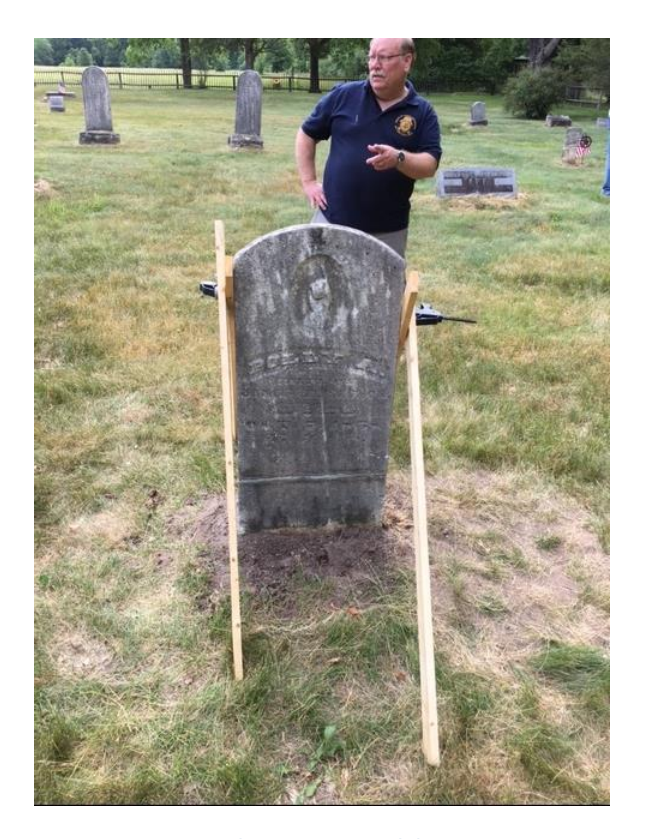
Repaired gravestone with bracing