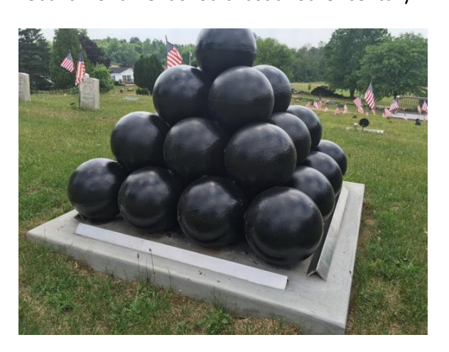
East Cooper Cemetery

Below is one of the two cannon ball stacks. The cannon balls were welded into a stack, and then a stainless retaining brace was added on all four sides as an extra measure of safety. This rebuilt monument should last another century.