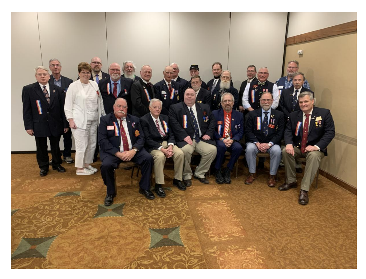
Brothers attending the Encampment in person