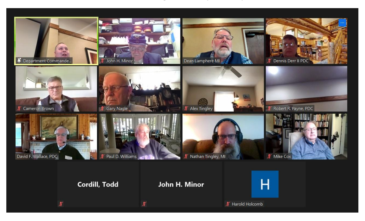
Brothers attending the Encampment virtually