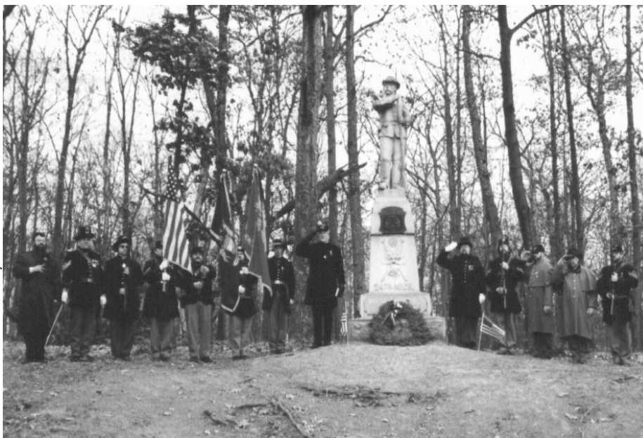
Remembrance Day at the 24th Michigan Monument, Gettysburg Battlefield