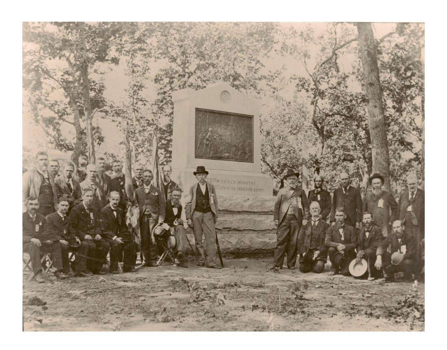
Dedication of the Michigan Monument at Chickamauga, September 18, 19 & 20, 1895

This boy attracted the attention of the noble-hearted Thomas, who sent him to school at his own expense, then obtained an appointment for him at West Point, and he is now a very gentlemanly officer of the army. (written 1882)