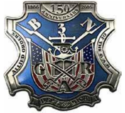
150<sup>th</sup> Department of Michigan Anniversary Approximately 1-3/4" x 1-3/4" $5.00 each Limited Quantity