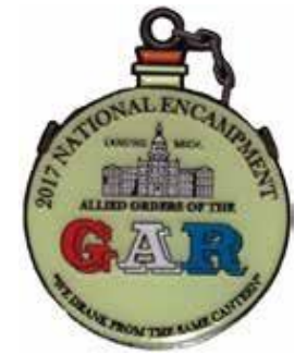
y 2017 National Encampment Banquet Table Favor Approximately 1" in diameter Very $3.00 each Limited Quantity