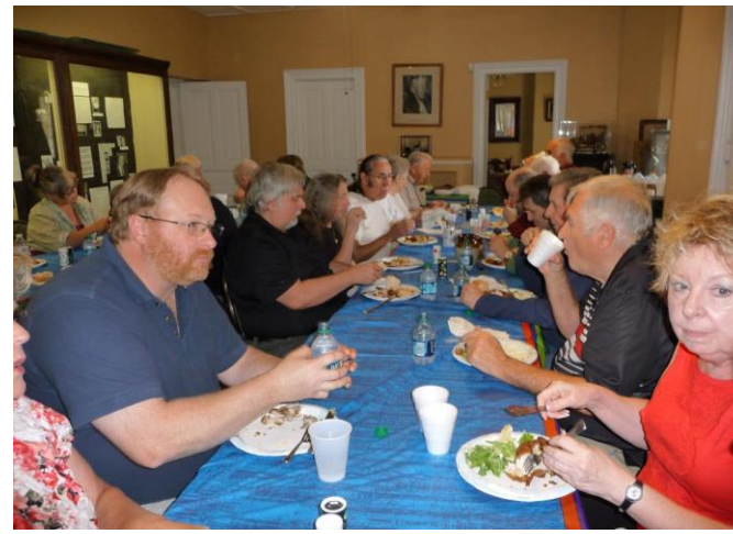
Many of our families joined for the summer picnic.

Camp 427 was joined by our local DAR group at the 2018 Decoration Day Ceremony