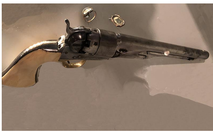
Harrisburg Civil War Museum