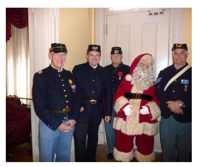
Providing a service for the local Museum