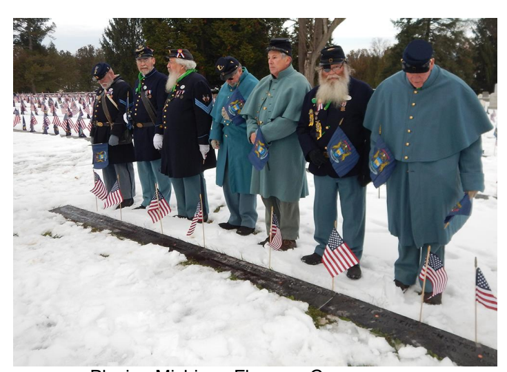
Placing Michigan Flags on Graves.

Members from various Camps and Allied Orders within the Department participated in its annual placing of National and State of Michigan flags on the graves of Michigan soldiers in the National Cemetery which included a memorial service and reading of the soldiers interred there.