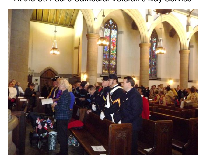
At the St. Paul's Cathedral Veteran's Day Service

This a photo album of some of the activities of Camp 427 the past quarter.