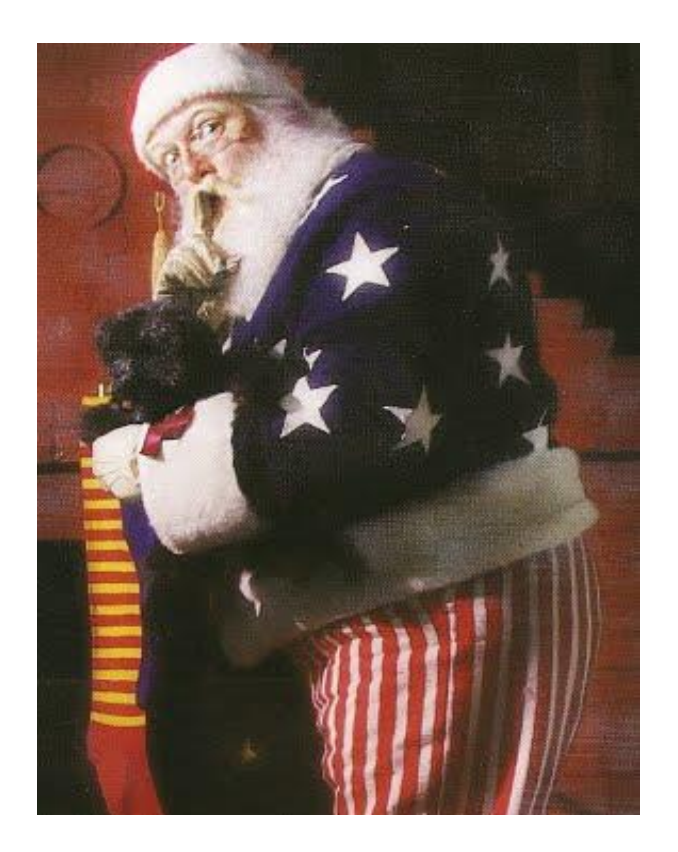
In the Dress of Nast's 1863 Harper's Weekly Style