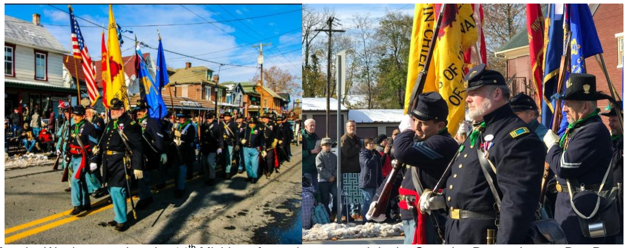
After the Woolson service, the 14<sup>th</sup> Michigan formed up to march in the Saturday Remembrance Day Parade.