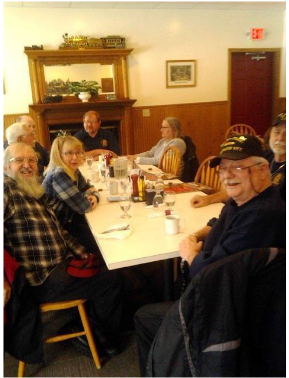
Camp 20 held our annual Winter Thaw luncheon on Saturday, January 25, 2020. The event was held at the newly reopened Club Car Grill on D Avenue in Cooper, MI. About twenty brothers and friends of the camp braved the winter weather and shared comradery and a pleasant lunch.