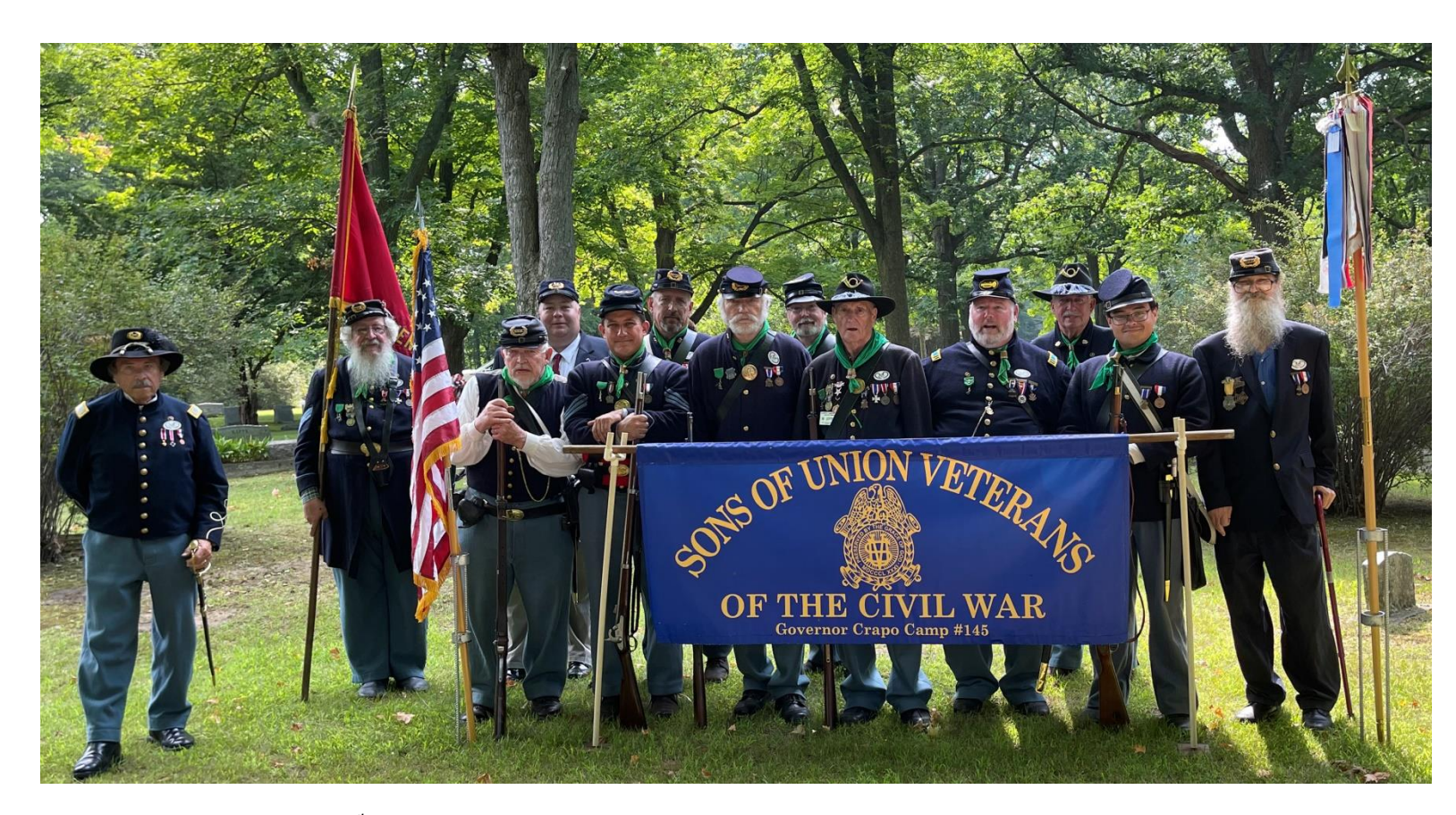
Company A, 14<sup>th</sup> Michigan SVR will continue to support and provide its services to Michigan Camps, Sons of Union Veterans of the Civil War.