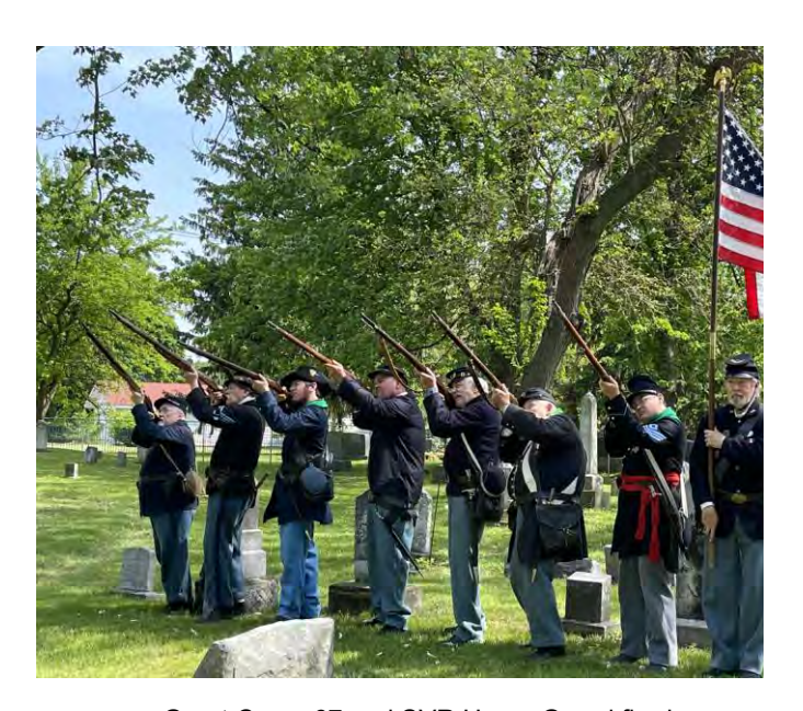
Grant Camp 67 and SVR Honor Guard fired a ceremonial salute.