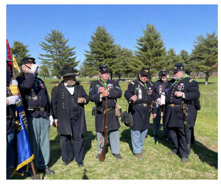
Following the Lincoln Tomb Service, the Michigan contingent traveled to Petersburg, Illinois for services at the Stephenson Monument. At the end of the service, the traditional "Take a Drink" "Leave A Drink" was hosted by Company A, 14<sup>th</sup> Michigan Infantry.