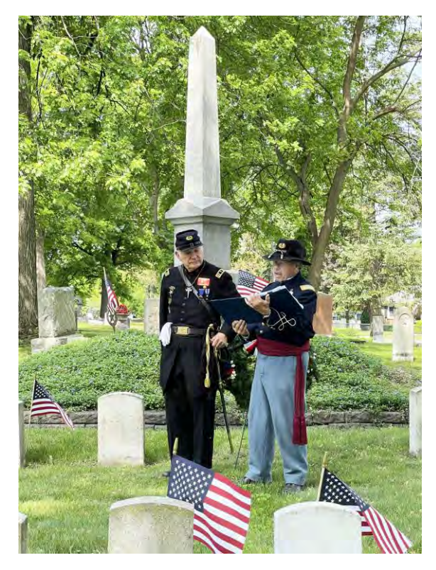
Grant Camp 67 Memorial Day Service.