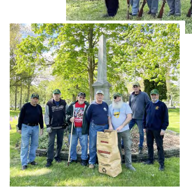
14<sup>th</sup> Michigan Company A, Sons Of Veterans Reserve performed a musket salute at Aventine Cemetery.

Brothers of U.S. Grant 67 participated in their annual Cemetery Clean-Up at Soldiers Rest Cemetery and GAR Monument.