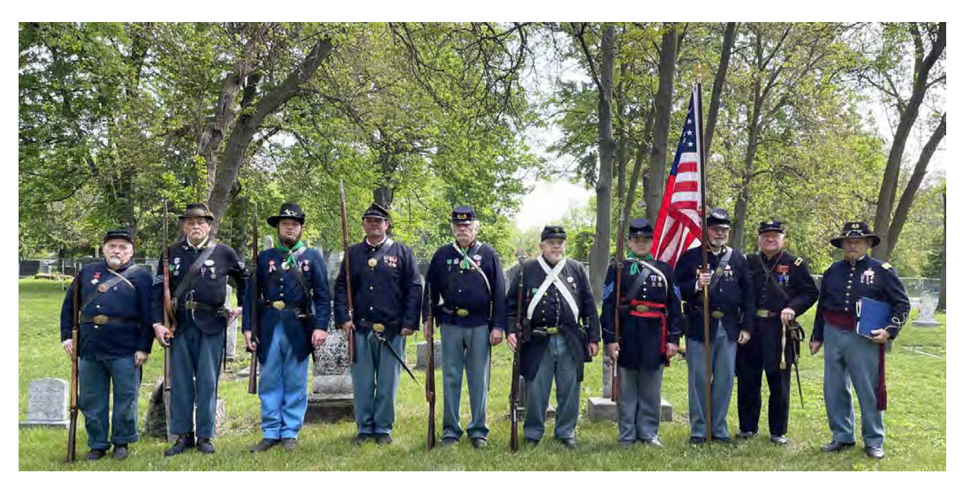
Grant Camp 67 and SVR Honor Guard.