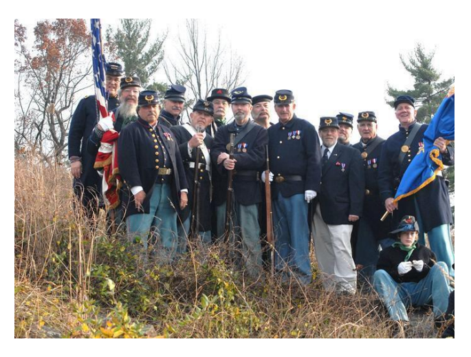
Shaw and Harrison at Little Round Top, Gettysburg