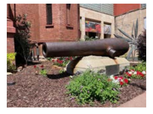
At the Confederate Museum