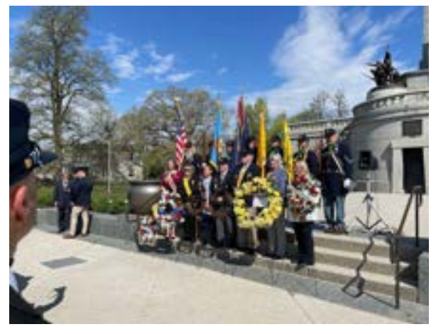
Department "On the Road" Continued