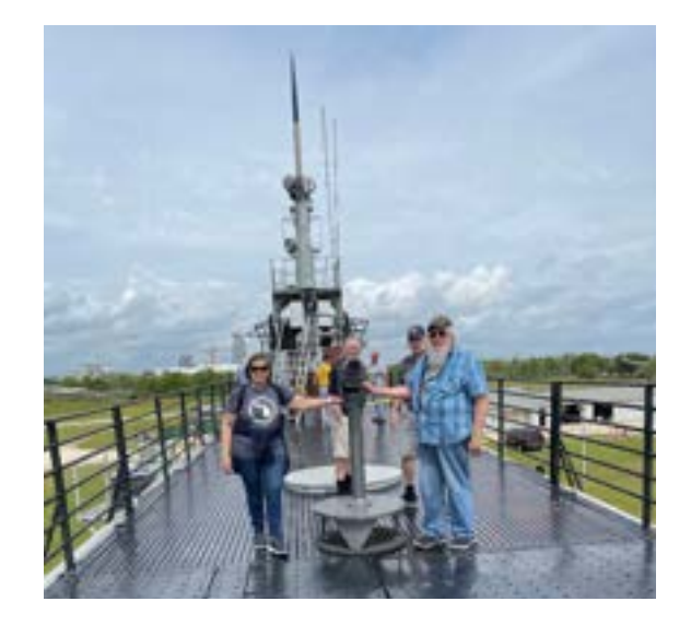
Aboard the Submarine USS Drum