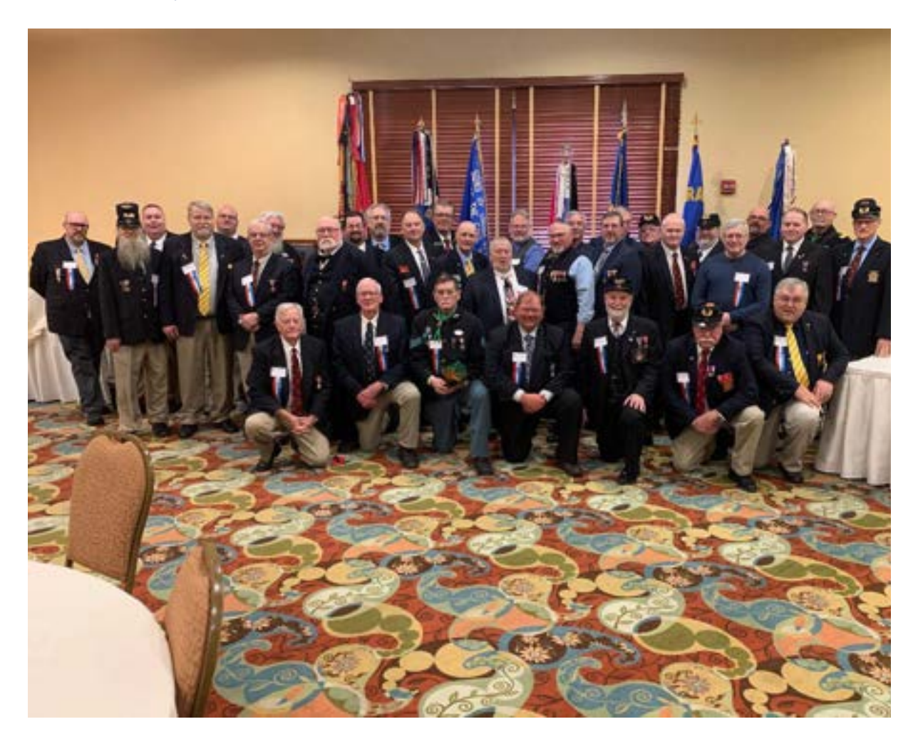
2023 – 2024 ELECTED AND APPOINTED DEPARTMENT OFFICERS

Recipient of the Marshall Hope Award for Best Department Newsletter of the Order 2002, 2007, and 2011