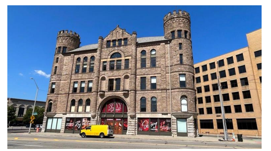
Sexy Steak, a new project by Prime Concepts Detroit, will take over the Grand Army of the Republic Building, replacing Parks & Rec Diner and The Republic.

Since the eateries of Detroit's Grand Army of the Republic Building, casually known as the GAR Building, closed shop during the COVID-19 pandemic, frequent diners have been curious to learn of the new steakhouse and event space that would replace the once beloved Republic and Parks and Rec Diner.