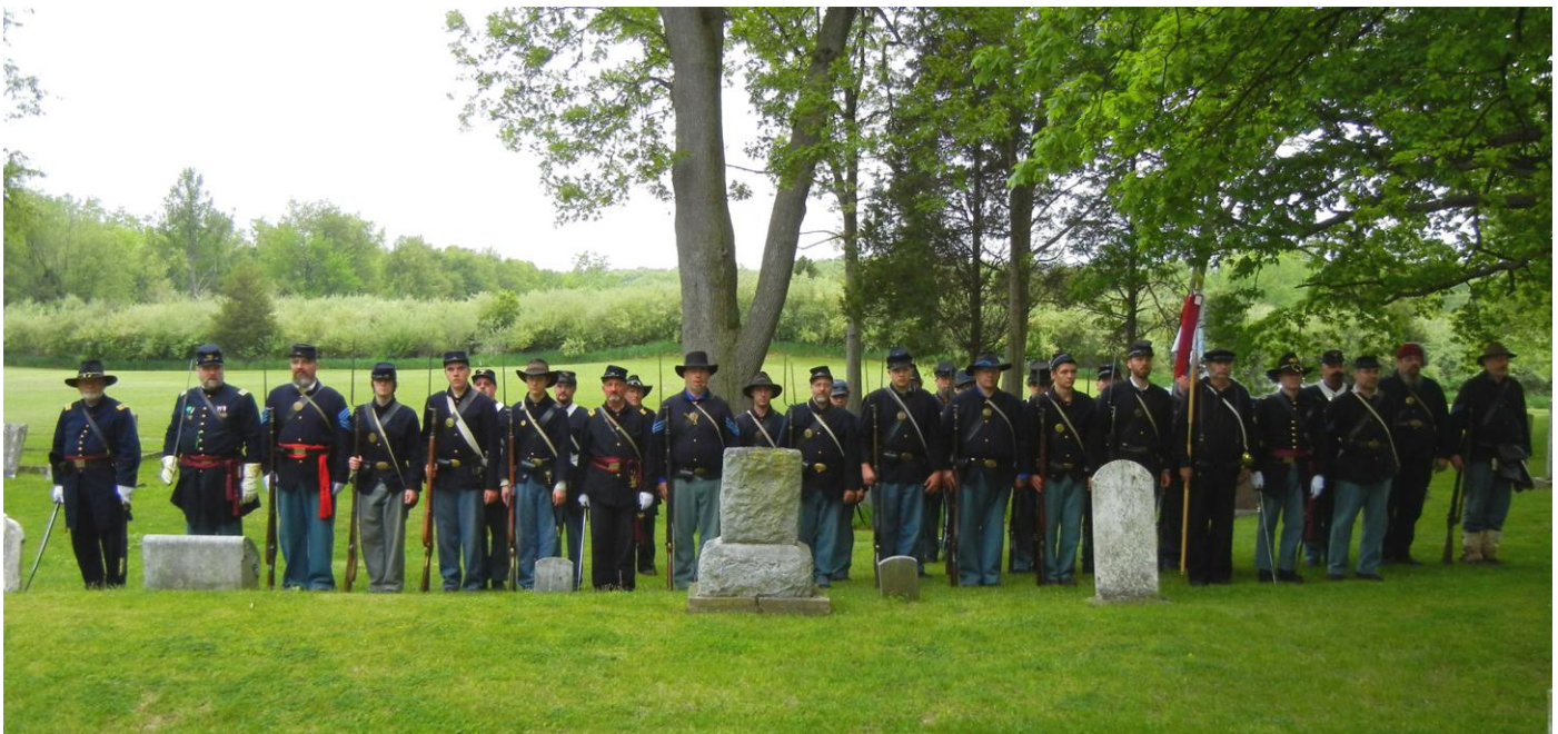
The SVR at Walker's Tavern

1691 Summerfield St. SE Grand Rapids, MI 49508-6499 (616) 827-3369 civil-war@comcast.net