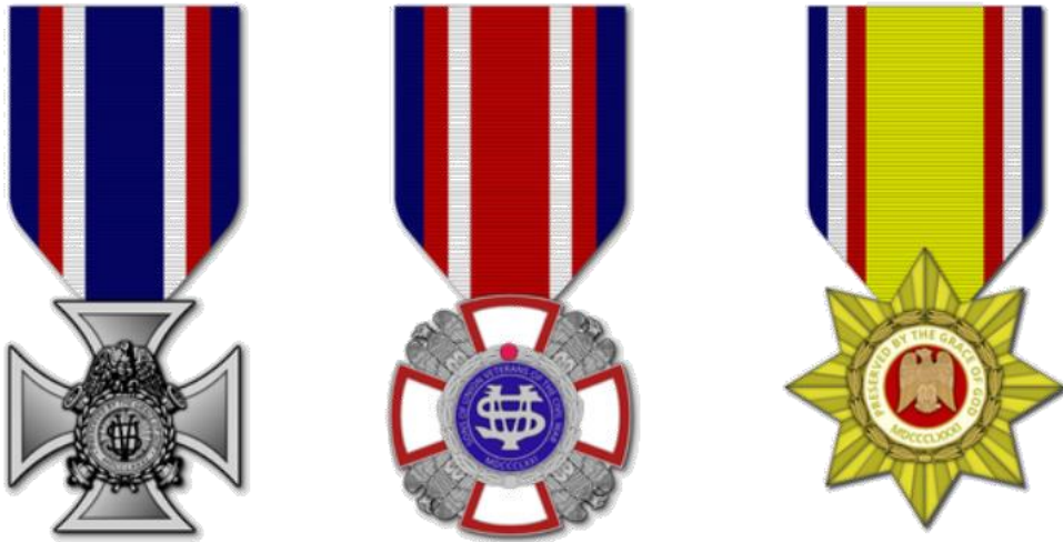
Left to Right: Past Camp Commander Badge, Past Department Commander Badge, and Past Commander-in-Chief Badge

Upon completion of their term of office, Camp Commanders, Department Commanders, and Commanders-in-Chief wear the badges displayed below: