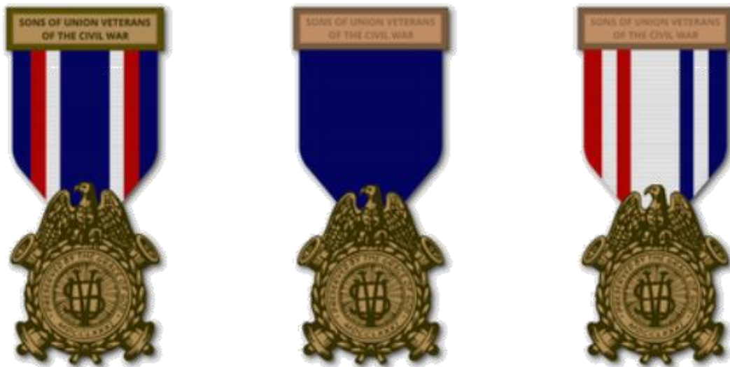
Left to Right: Member Badge (Hereditary), Associate Badge, and Junior Badge

In this issue, a quick review of the various types of SUVCW membership and officer badges (Badges of the Order) will be covered, as well as a short description of who is authorized to wear such badges. A review of proper wear of the badges will be covered in a future issue, or can be examined earlier at: SUVCW Blue Book: REGULATIONS, Chapter V - General Regulations, Article VI - Badges & Medals