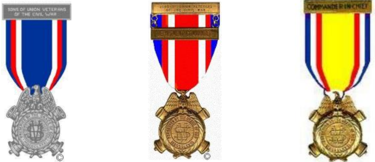
Left to Right: Camp Commander Badge, Department Commander Badge, and Commander-in-Chief Badge

The following badges are issued to Camp Commanders, Department Commanders, and the Commander-in-Chief upon their installation to their respective office. They are not permitted to be worn once they have completed their term and departed their respective office.