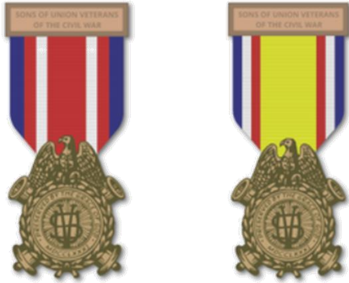
Left to Right: Department Officer (elected) and National Officer (elected)

The following badges are issued to Camp Commanders, Department Commanders, and the Commander-in-Chief upon their installation to their respective office. They are not permitted to be worn once they have completed their term and departed their respective office.