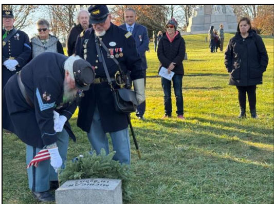
14th Michigan SVR Gettysburg Memorial Service