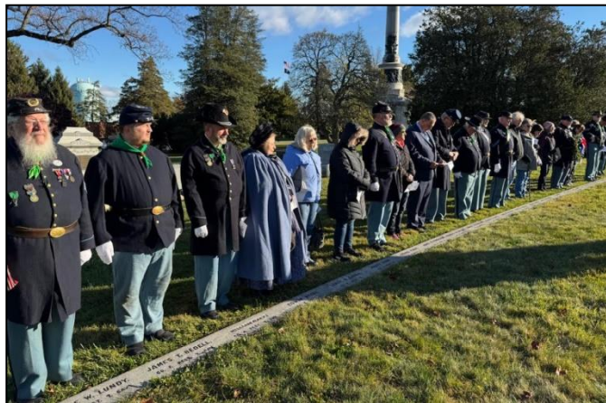
14th Michigan SVR Gettysburg Memorial Service