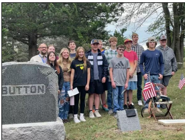
Above Left: The gravesite of Oren Button.