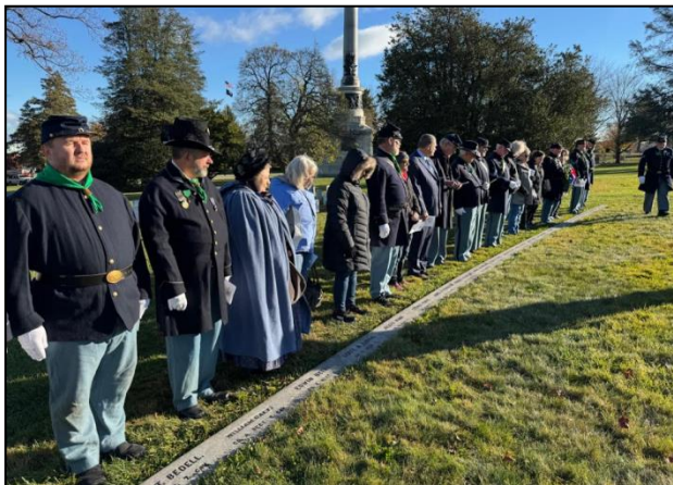
14th Michigan SVR Gettysburg Memorial Service