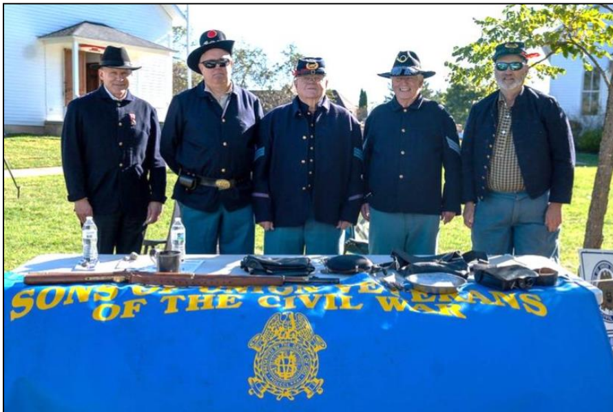
Above: Brothers of Camp No. 17 and Camp No. 58 at the Heritage Festival, Meridian Historical Village.