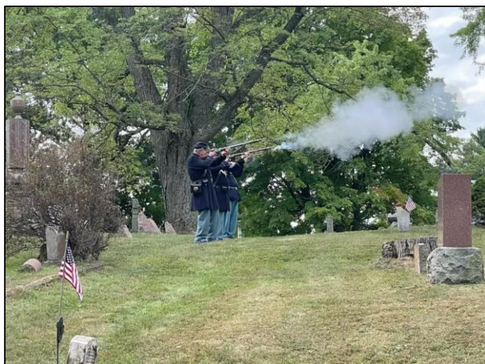
Above Right: Camp 444 Honor Guard firing a volley