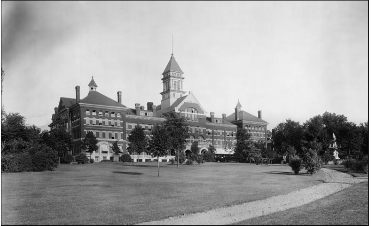
Michigan Soldiers' Home, Grand Rapids, Michigan circa 1900-1910