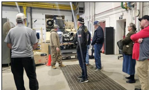
Above Right: The tour inside one of the maintenance bays at MATES.