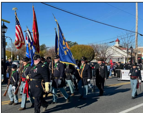
14th Michigan SVR Gettysburg Remembrance Day Parade