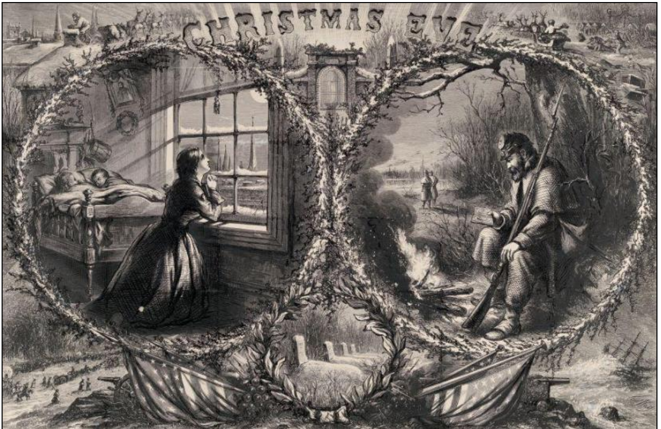
"Christmas Eve" an illustration by Thomas Nast for Harper's Weekly, 03 January 1863