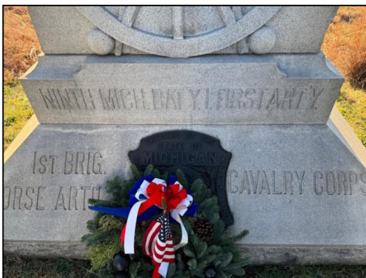
14th Michigan SVR Gettysburg 9th Michigan Artillery Memorial Service