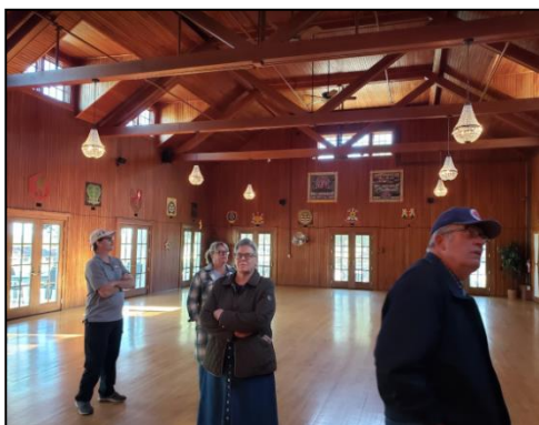
Above Left: Touring the historic Camp Grayling Officer's Club, built in 1917.