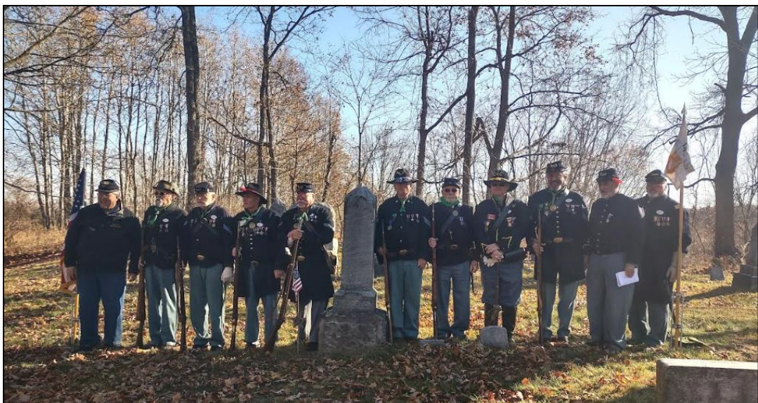
Company A, 14 th Michigan Infantry (Irish Rifle) – Sons of Veterans Reserve