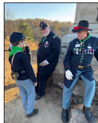
14th Michigan SVR Gettysburg 9th Michigan Artillery Memorial Service