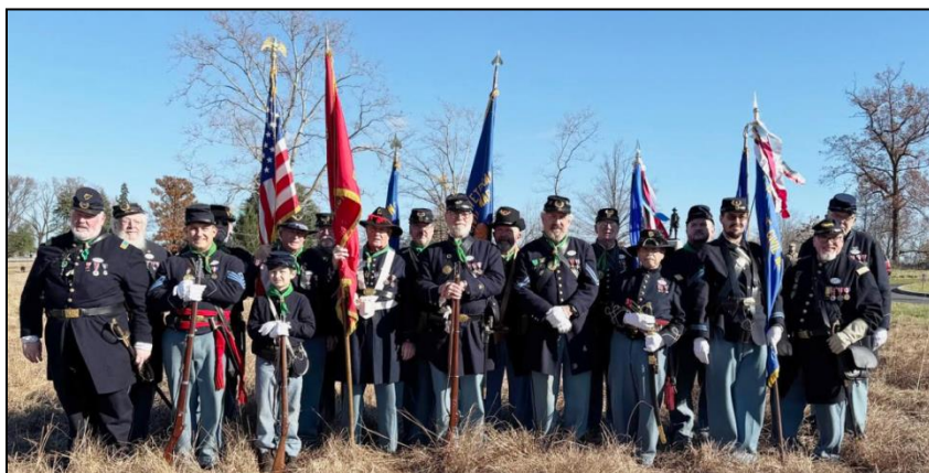
14th Michigan SVR Gettysburg Remembrance Day Participants