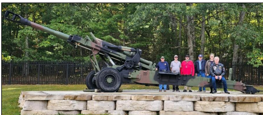
Above Right: M198 155mm Howitzer near the Camp Grayling Front Gate.